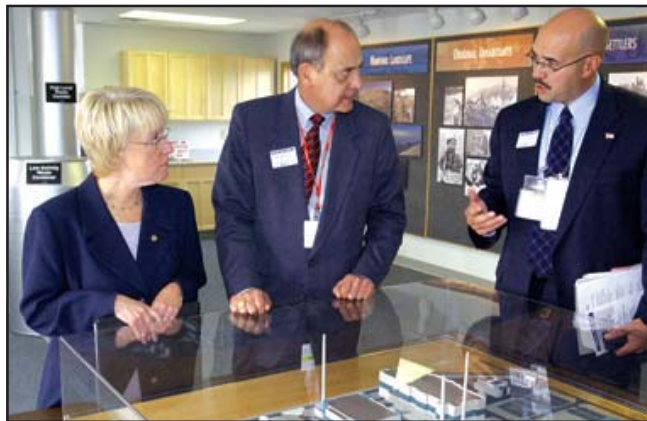
In 2001, Congressman Doc Hastings, center, joined Senator Patty Murray on one of many visits he made to the Hanford Site in support of environmental cleanup.

Doc Hastings fought battles and strived to balance the budget for the betterment of all those he represented back home, and he did it with an